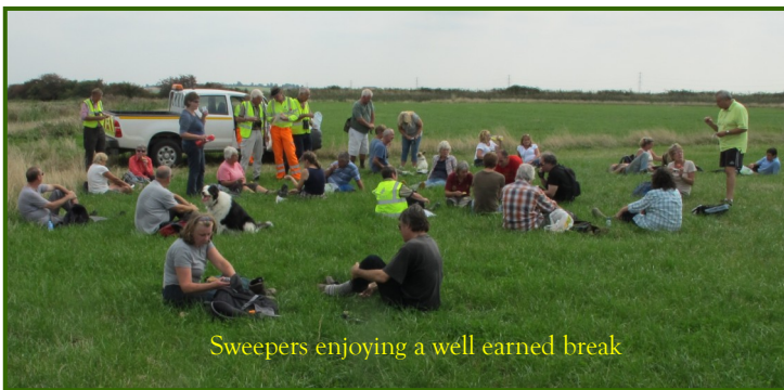
Sweepers enjoying a well earned break

200 metre gap in the sea defences creating what will become a lovely salt marsh. Immediately before this local people were invited to help sweep the area to encourage