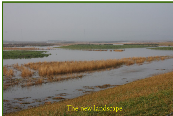
The new landscape

The Annual Firework Display will be on Sunday 2nd November on The Common and the ever popular Senior Citizens' Christmas Dinner will be on Saturday 6th December. And on the following day the lighting of the village Christmas tree will take place at 6pm.