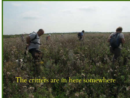
The critters are in here somewhere

We hope you have enjoyed what has been a lovely summer, although August when the children were off school was not so good. Irrespective of the weather it has been an exciting time for those interested in wildlife and the countryside. The River Parrett was breached last week allowing the tide to surge in through a