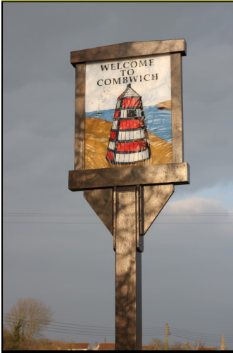
Welcome to Combwich