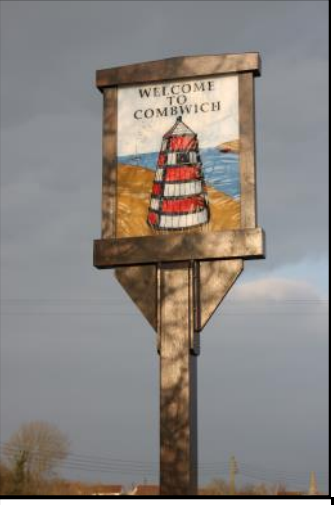
Welcome to Combwich