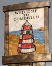
Welcome to Combwich