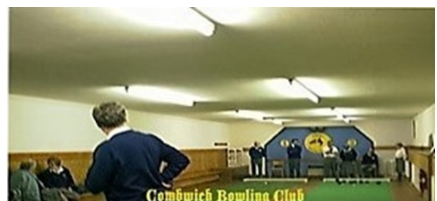
FIRST FLOOR OTTERHAMPTON VILLAGE HALL, COMBWICH

The fact is that people are prosecuted for this offence up and down the country and until we succeed in eliminating in Combwich, the PC will continue to bring this issue to your notice. We are in the process of setting up a meeting with the Dog Warden and with the Police, to look at the possibility of taking the offenders to Court. Please clear up after your dog. If you don't, you have been warned.