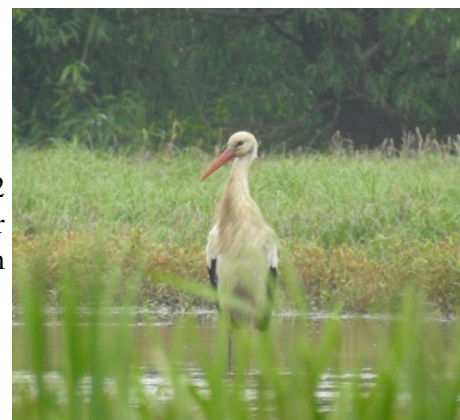
White stork on Stockland Marshes (Roger Musgrove)

We've had the excitement of 2 rarities on the reserve: a flyover Bee-eater and a White Stork on Otterhampton and Stockland.