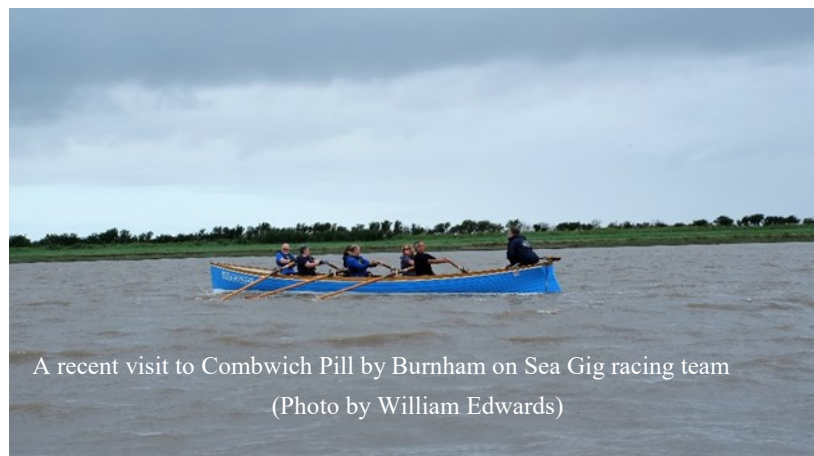
A recent visit to Combwich Pill by Burnham on Sea Gig racing team