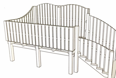
Design drawing provided by Buscott Woodworking