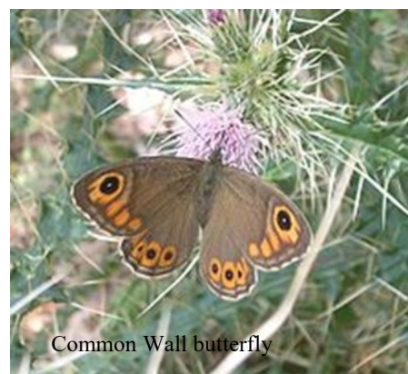
Common Wall butterfly