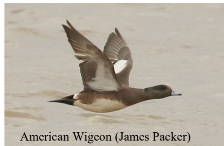
American Wigeon (James Packer)

More info can be found at; https://twitter.com/WWTSteart