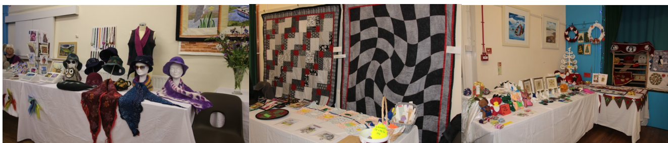
A few examples of the beautiful work by Combwich Crafters - sorry there is not the space to show all the wonderful exhibits

Why not have you family name immortalised on the wall hanging for only £5. Contact Sue Jacobs on 652450