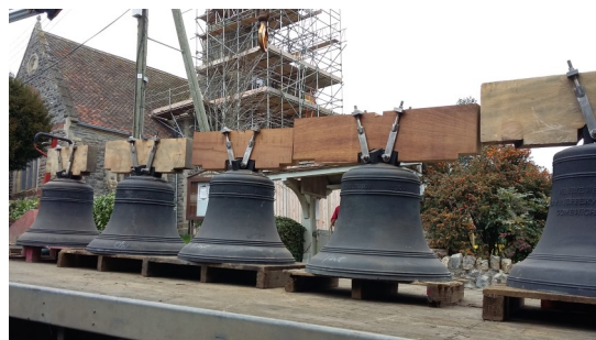
The bells returning