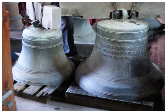
As part of the ongoing restoration work at St Peter's Church Combach, the bells are all set to be sent away for retuning which will take about 3 months