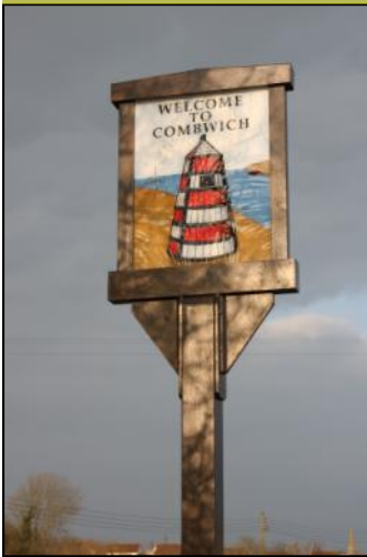
Welcome to Combwich