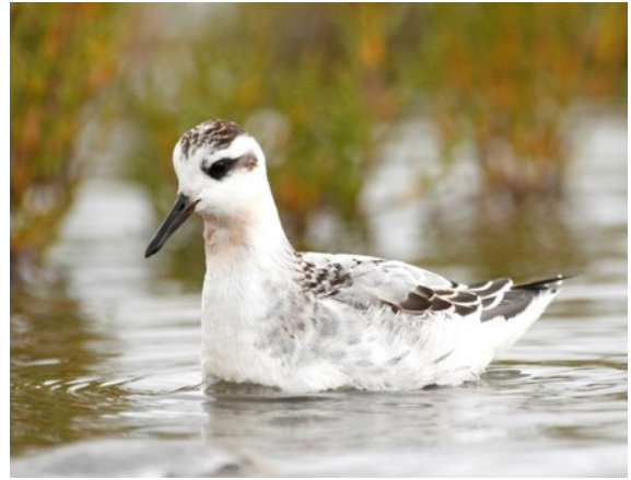
Grey Phalarope (Joe Cockram)

We have also had a spoonbill on the reserve for over 6 weeks which illustrates how much food there must be for it to stay here so long. The Spoonbill feeds mainly on fish , shrimps and it will also eat other crustaceans and aquatic insects . The structure of its bill limits it to feeding in water that is less than 40 cm deep over sand, mud or clay, where it can sweep the water with its bill.