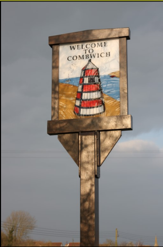
Welcome to Combwich