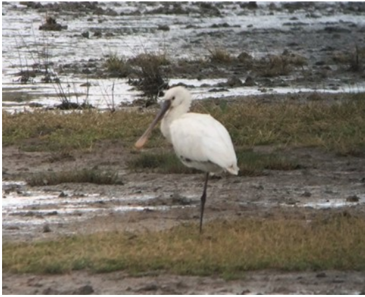
Juvenile Spoonbill (Joe Cockram)