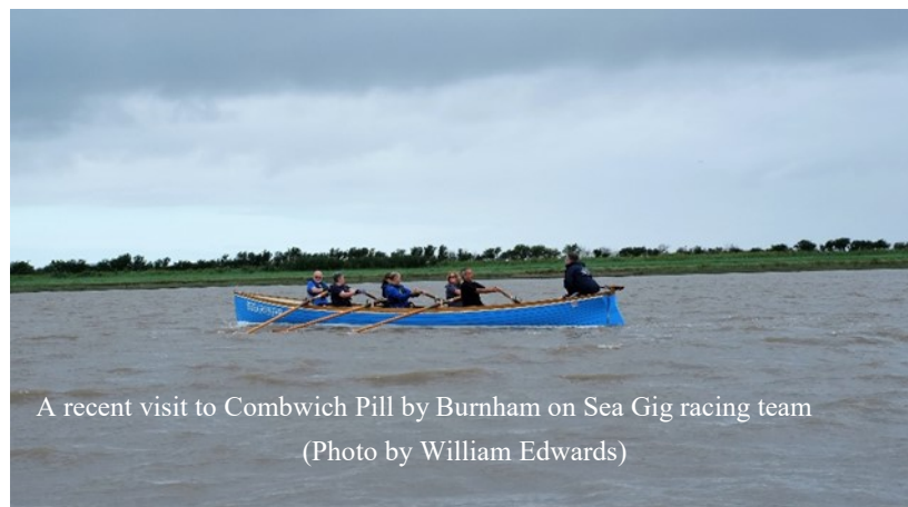
A recent visit to Combwich Pill by Burnham on Sea Gig racing team