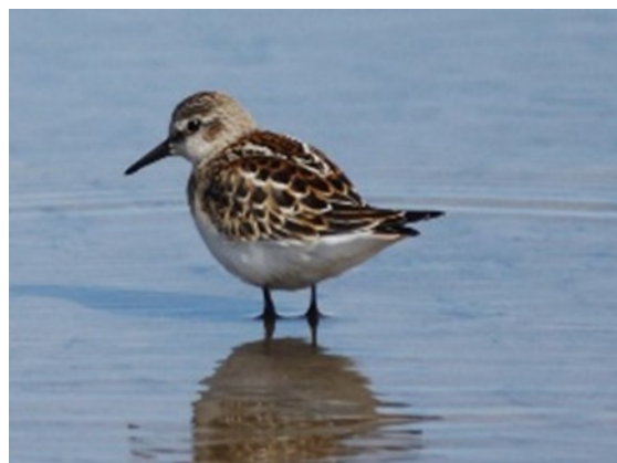
Little Stint

Throughout October wintering bird numbers are starting to build up, including waders such as Redshank (peak 750) Lapwing, Golden Plover, Grey Plover and Dunlin. A good count of 320 Black Tailed Godwit seen on the lagoon by the breach was notable along with a flock of around 60 Bar Tailed Godwit. There has also been good numbers of passage birds moving through such as Little Stint, seen in groups as large as 13 stopping in whilst on migration from the Arctic to Africa.