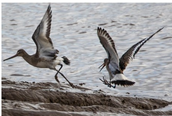
Black-tailed godwit

A Turnstone was also seen from the horseshoe screening which only occasionally are seen on the reserve as they spend most of their time along shorelines. Wintering Avocet have been seen from the reserve in numbers of up to 300 on the River Parrett. Wintering Wildfowl are also on the up including Wigeon and Teal with some of the slightly later arrivals like Pintail and Shoveler being spotted around the reserve.