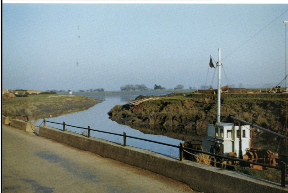
Start of Wharf Construction at Combwich Taken on 1 January 1958

If you have pictures of old Combwich, Otterhampton, or Steart that you would care to share with readers, contact the editor.