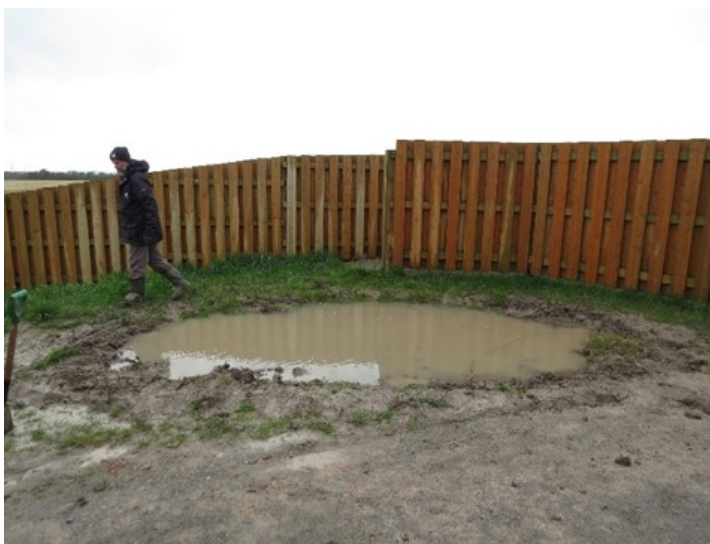
Pond by Quantock Hides filled by rainwater