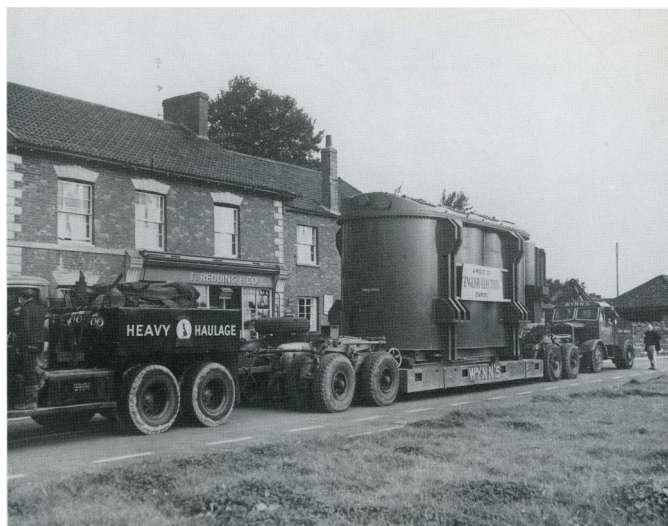
Generator Transformer on Transporter by No. 22 Brookside Road, Combwich Taken on 10 October 1960