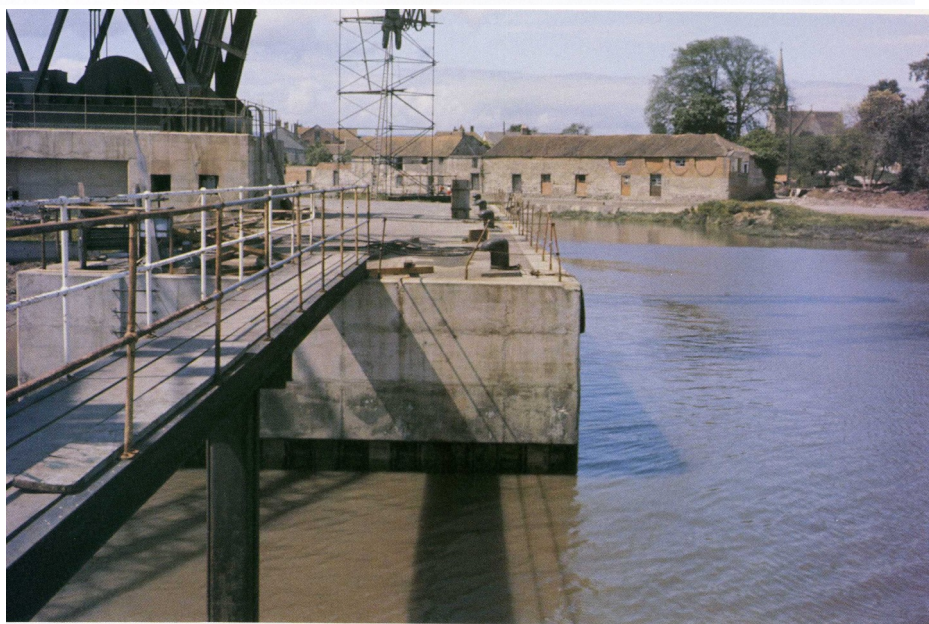
Wharf at Combwich Taken on 4 June 1961