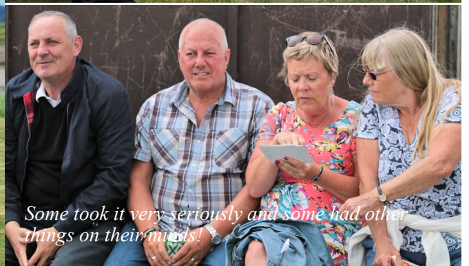
Some took it very seriously and some had other things on their minds!

Just like to finish off by saying a huge thanks to all that came along and contributed to the charities, hope you all had a fantastic day and hope to see you next year!