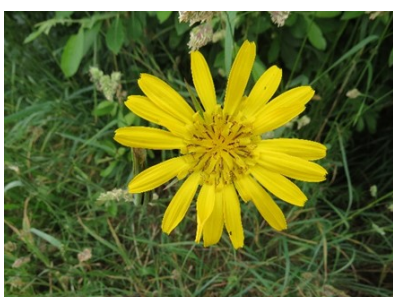
Tragopogon pratensis in flower and in seed Ronan Conn (WWT)

Goat's-beard ( Tragopogon pratensis ) is coming up nicely throughout Steart Marshes and the surrounding area, it can most commonly be found along road verges and the dryer hedge rows. It looks like a much larger and better formed dandelion, with a similar flower and seed head (see images). Another common name for Goat's-beard is Jack –go-to-bed-at-noon due to the fact it's flowers are only open in the morning