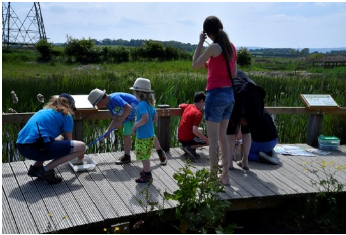
Pond dipping on the Open Day held on the 20 th May.