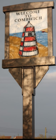
Welcome to Combwich