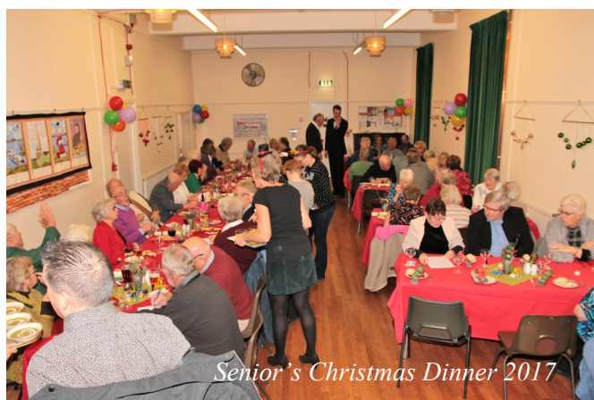
Senior's Christmas Dinner 2017