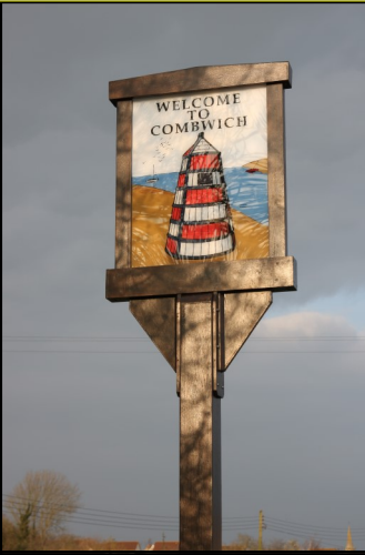
Welcome to Combwich