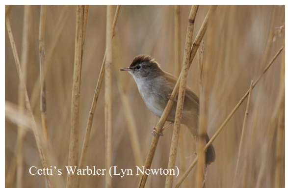
Cetti's Warbler (Lyn Newton)

March marked the end of the winter period, with all but a few wildfowl remaining on Stockland and Otterhampton Marsh. But with most of the wintering birds now gone, summer migrants are moving in and breeding season has kicked off. Cetti's warblers can be heard around the reserve, with their distinctive low bubbly call coming from the reed beds and a pair of coots have started building a nest within the wetland walkway. Summer breeding wader species have also moved in on Otterhampton Marsh with Avocet and Oystercatcher prospecting amongst a few. Written by Sam Wall (WWT Reserve Warden)