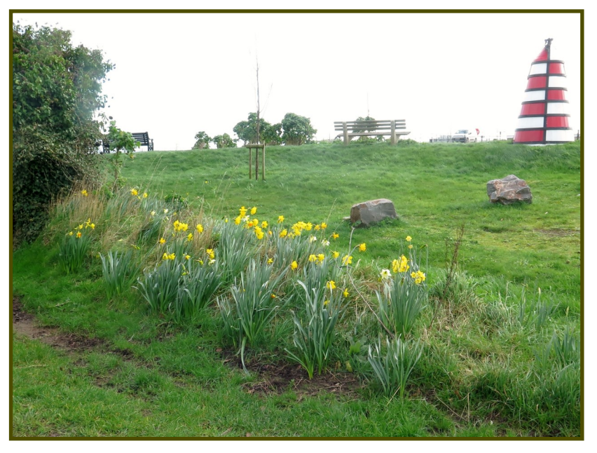
And daffodils resplendent throughout the village