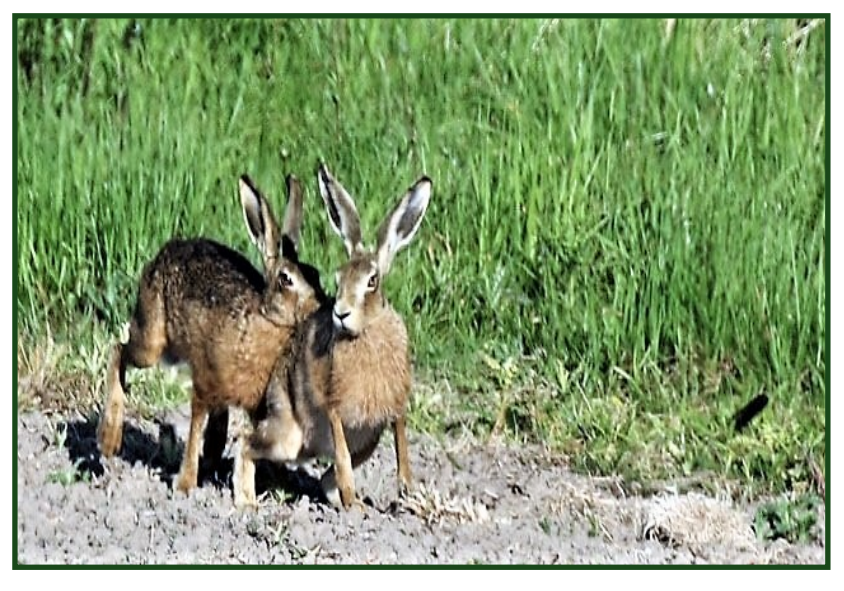
It doesn't feel like spring but these March Hares certainly think so.