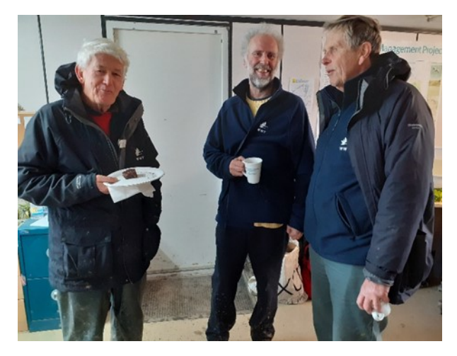
A big thank you to all of our volunteers for all of your help and hard work!

We have over 50 volunteers that help us with everything including: practical work, office work, surveys, visitor engagement, data entry and many other things.