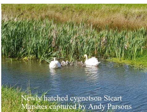
Newly hatched cygnet on Steart Marshes

As with everywhere, all our future activities are in limbo until we know the way forward from this pandemic. We sincerely hope it will not be too long before we can start socialising with our families, friends and neighbours. In the mean-time take care and stay safe.