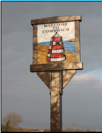
Welcome to Combwich