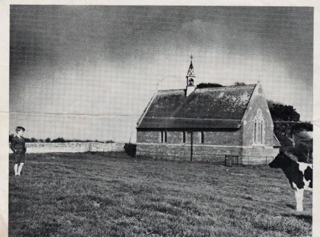
The little church at Steart