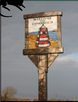
Welcome to Combwich