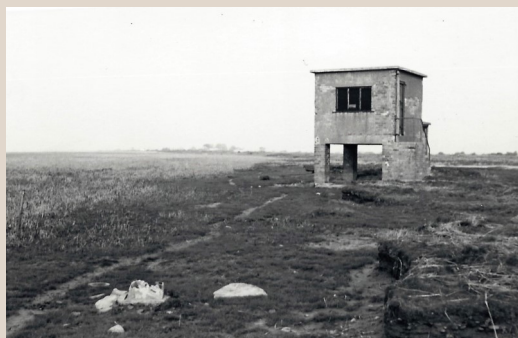
Reprinted from the "Bridgwater Mercury," May 1st, 1962.