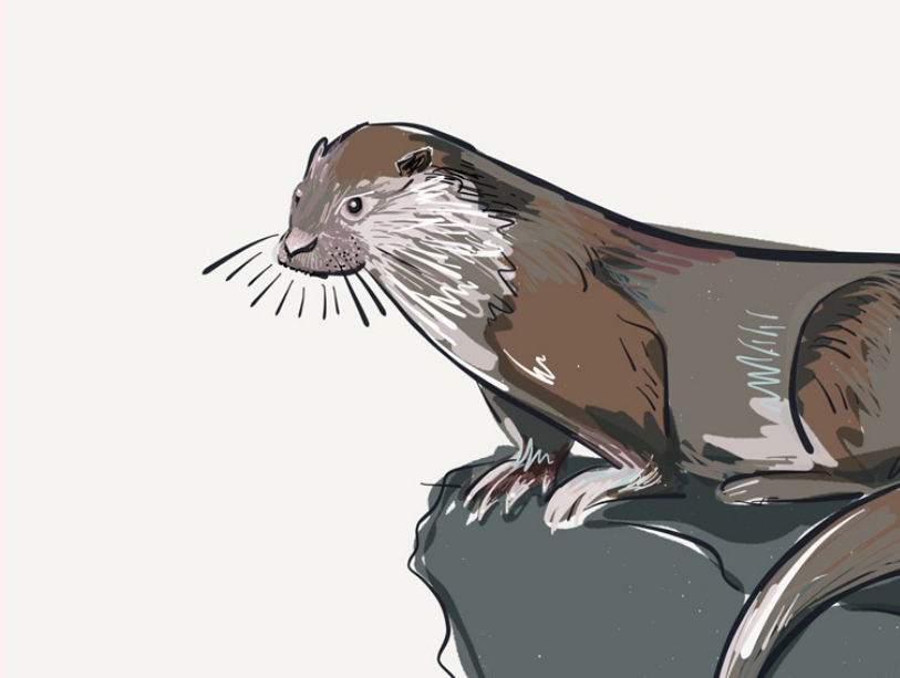
1 European Otter for SCC castles and coast walking booklet 2019 iPad Air PaperbyWetransfer