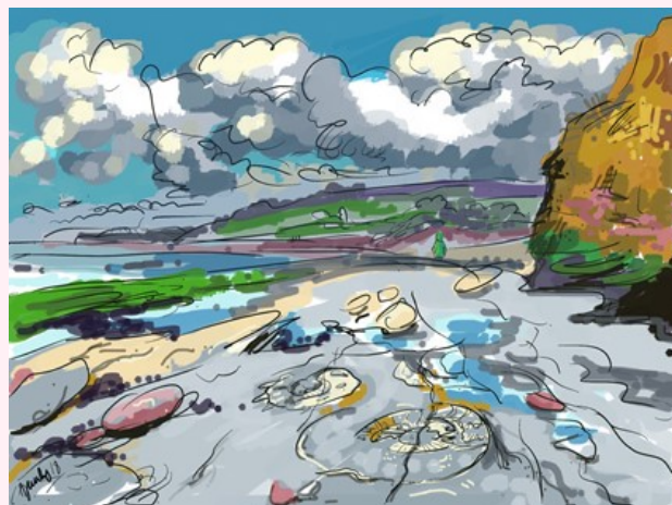
4 Helwell Bay 2018 iPad Air, Procreate