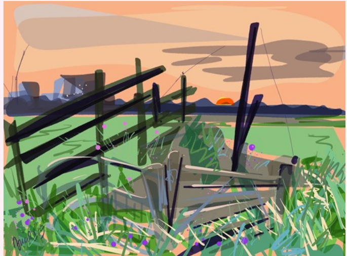
Stolford Sunset 2019 iPad Air PaperbyWetransfer