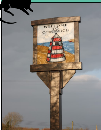
Welcome to Combwich