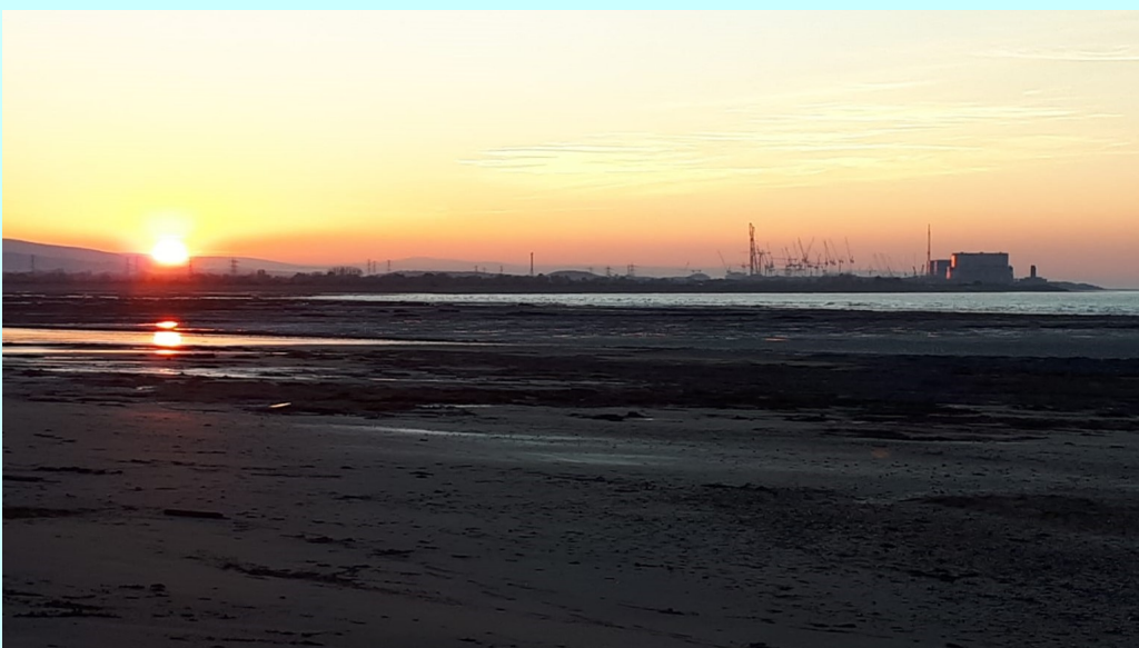
Sunset over Bridgwater Bay and Hinkley Point