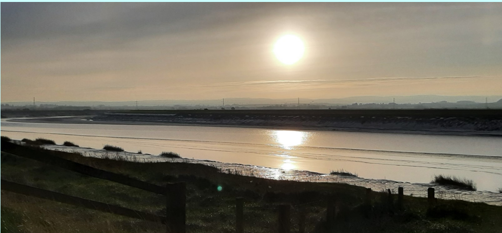
Day and night, taken by Tamsin Stevens