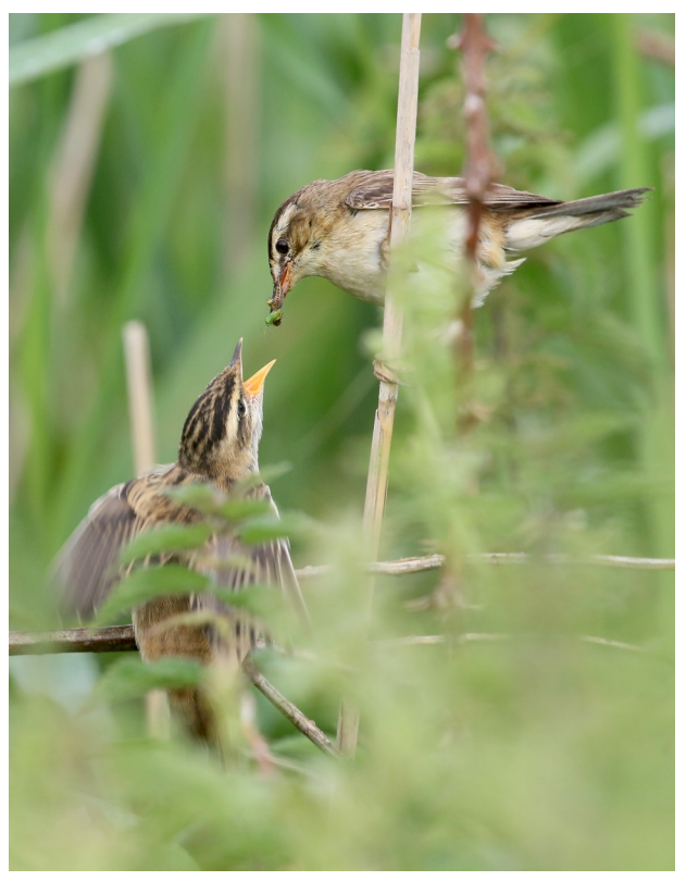
Adult Sedge Warbler feeding a fledgling

The first three photos were taken at Steart while in the bottom right corner is a male Araripe manakin taken in Ceará State, Brazil in November 2018. which appeared recently in the Guardian