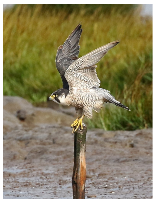
Peregrine stretching its wings at Steart Point