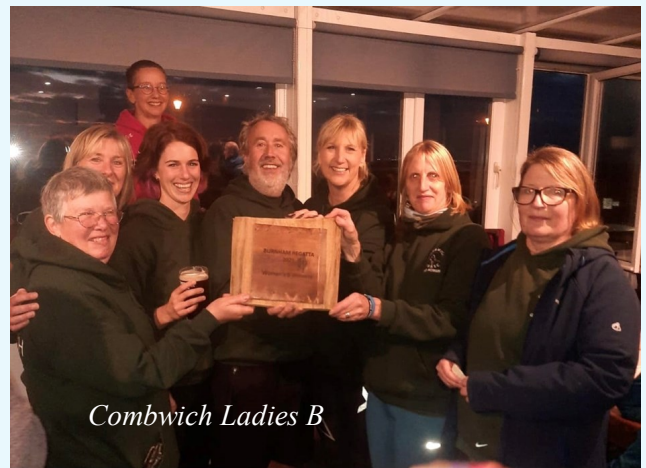
Combwich Ladies B