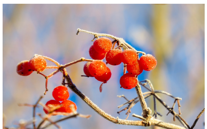
Guelder rose berries