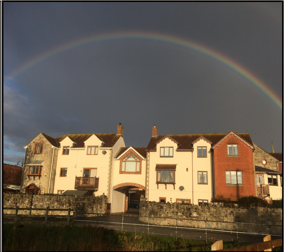
This lovely photo of a rainbow was taken on 16th February