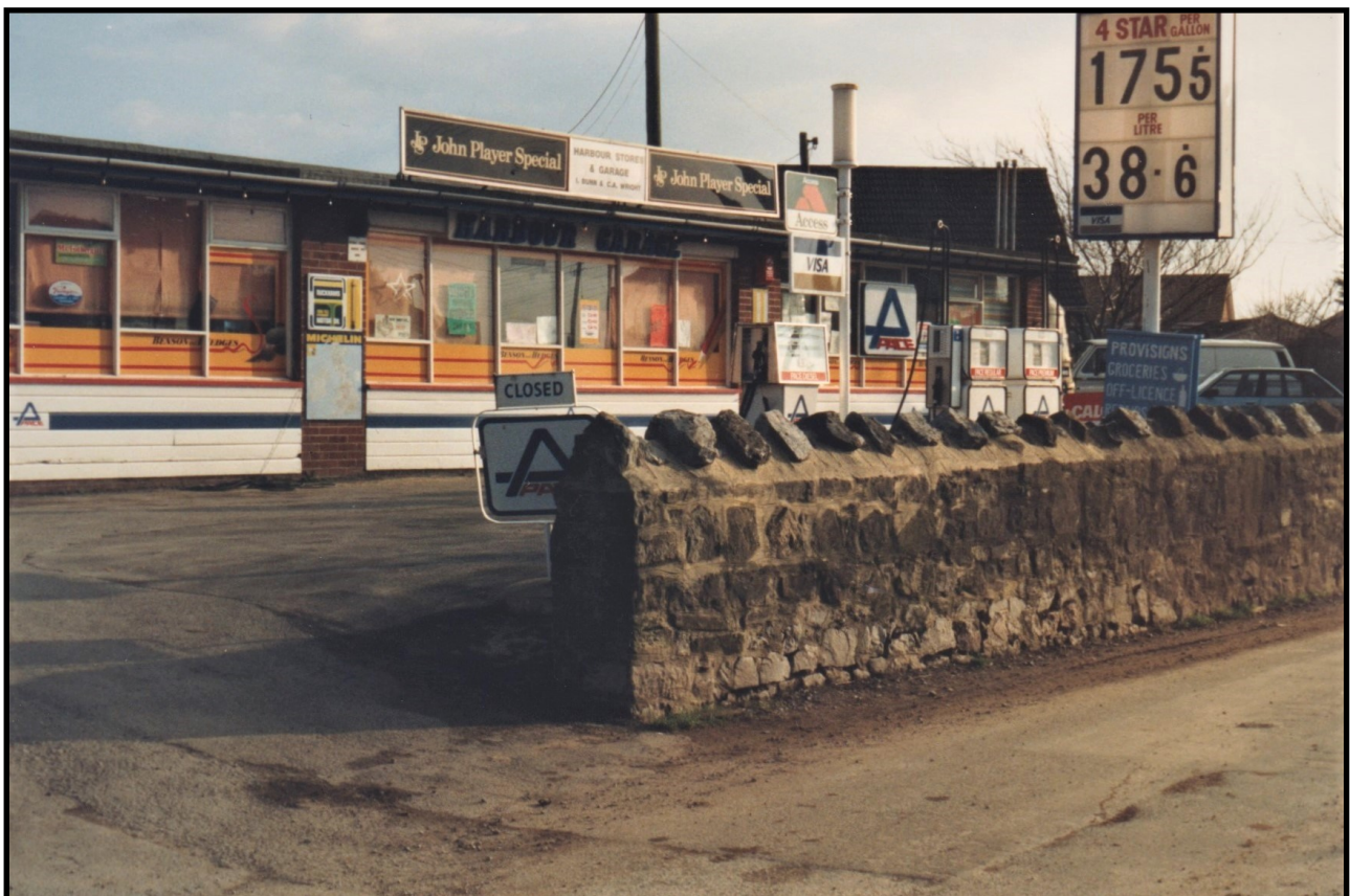
Older Combwich residents will remember this on the site of What is now Harbour Court