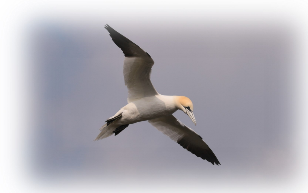
Gannet not taken at Steart Marshes, but at Bampton Cliffs in Yorkshire - ed