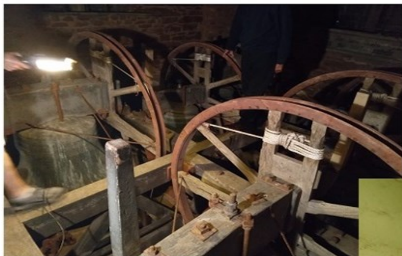
LEFT Inside St Mary's Bell Tower