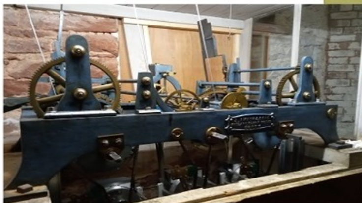
ABOVE The listed clock workings