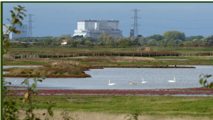
A lovely photo by Chris Tweedale