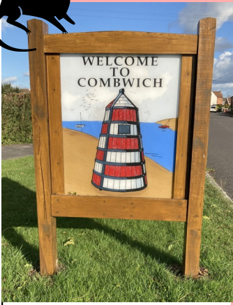
Welcome to Combwich