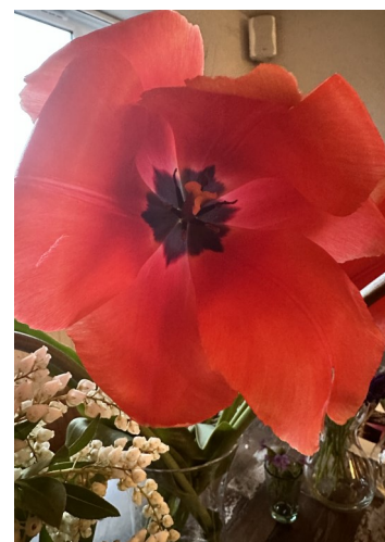
Another Stunning Entry