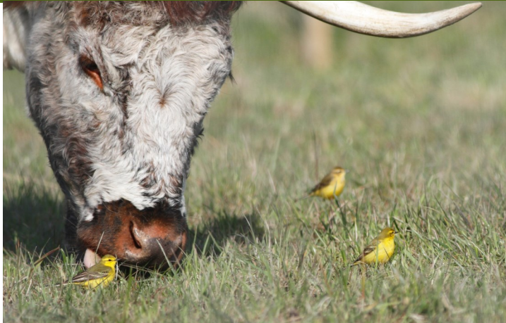
Old English Longhorn with yellow wagtails (Joe Cockram)