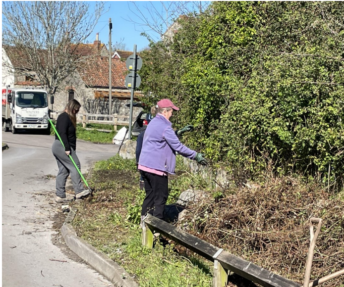
Parish Councillors and volunteers at work

Parish councillors and volunteers spent a morning working on Wharf Road, clearing areas, tidying up, making brashes and sowing wildflower seeds. If you would like to volunteer to help with the ongoing upkeep of Wharf Road, please contact the clerk.