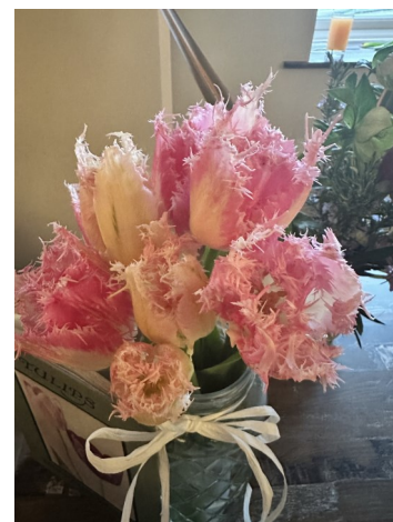
Winning Entry at April's pop up flower show

The events team will be arranging future events, including a plant stall at the coronation celebration. If anyone has any spare plants, we will be grateful as they will help raise funds for the club.