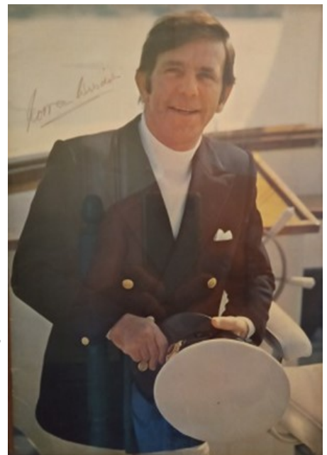
The very signed photo, framed on the wall!

Another reason why Her Majesty laughed....She knew it to be true!