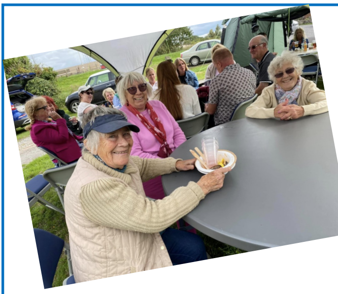
Paella day in the village hall and common

EVERYONE IS WELCOME Coffee and Cake after.